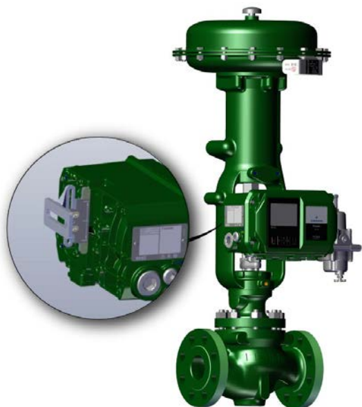
Figure 1. Linkage-Less Non-Contact Feedback System